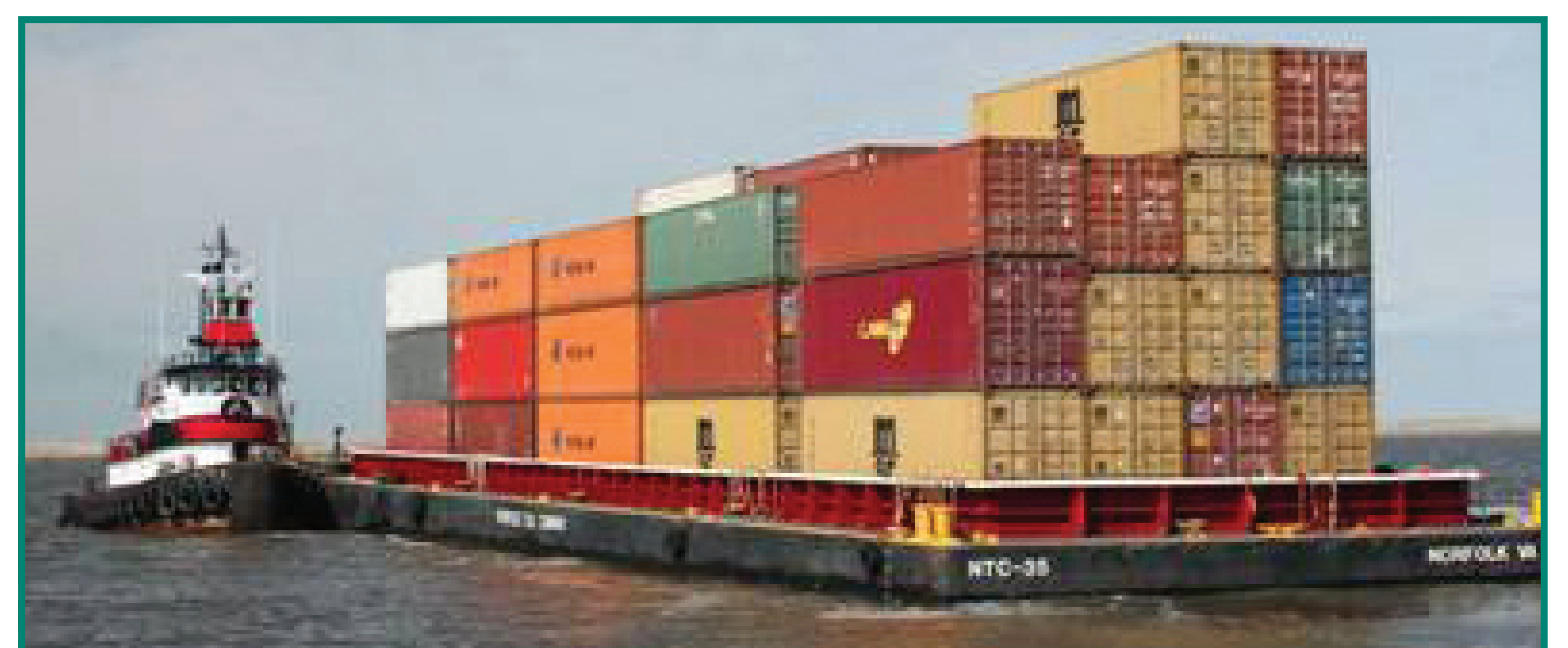
I-64 Express Barge